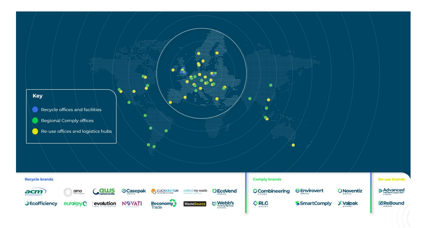
Figure 1 Reconomy loops and scope of operations

The International Labour Organization specifies the right of an individual to freely choose employment and defines forced labour as: