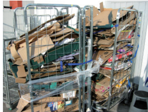
Potential material stream revenue

At a time when waste disposal and regulatory costs are increasing it is important that organisations minimise their waste and impact on the environment.